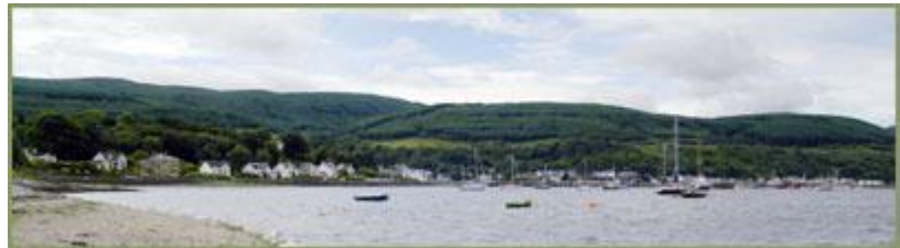
Sandbank and the Holy Loch

Dunoon is bordered to the north by the villages of Kirn, Hunter's Quay and Sandbank, and by the Holy Loch. Sandbank had 2 boat yards established in the late 1800's, one of which (Robertson's) built 2 challengers for the Americas Cup.