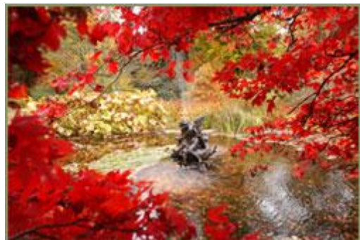
Benmore Botanic Gardens

Beyond Kilmun are Loch Long and the villages of Strone, Blairmore and Ardentinny. Blairmore's newly refurbished pier was officially reopened in May 2005 after decades of closure. North-west of Dunoon, following the A815 road, you will find beautiful Glen Massan where the River Massan is one of the best in Cowal for salmon and sea trout fishing and is a favourite spot with anglers . Beyond here, is Puck's Glen, a popular walking area, and the Benmore Botanic Gardens , one of Cowal's major attractions .